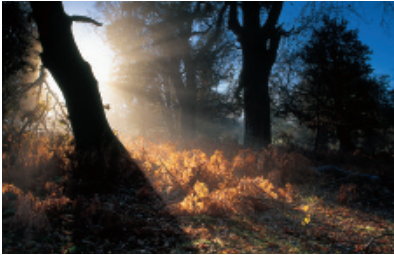
Beeches and bracken.