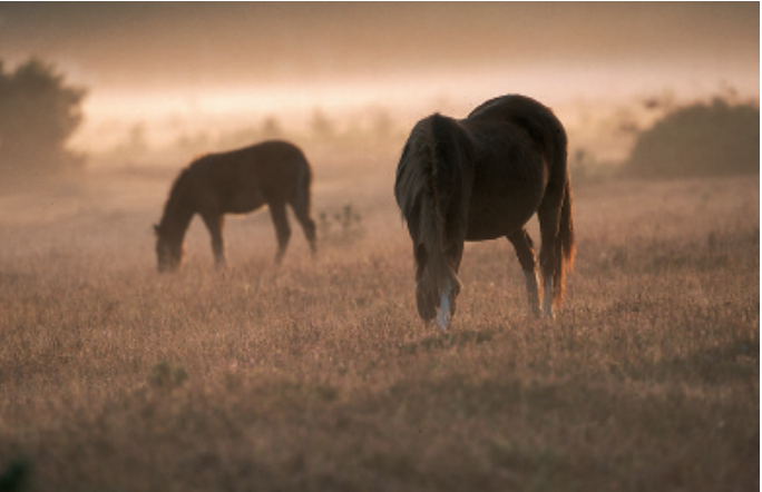
Mare and foal on Whitefield Moor.