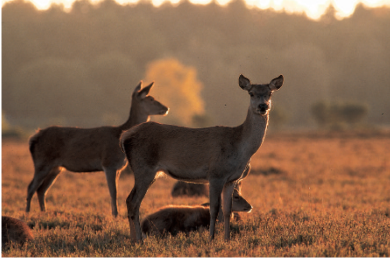
Red deer near Brockenhurst.