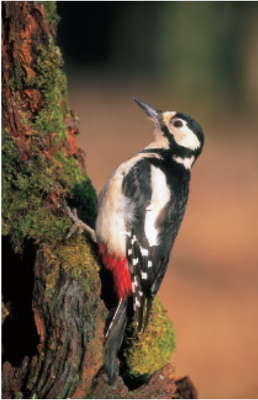
Great spotted woodpecker.